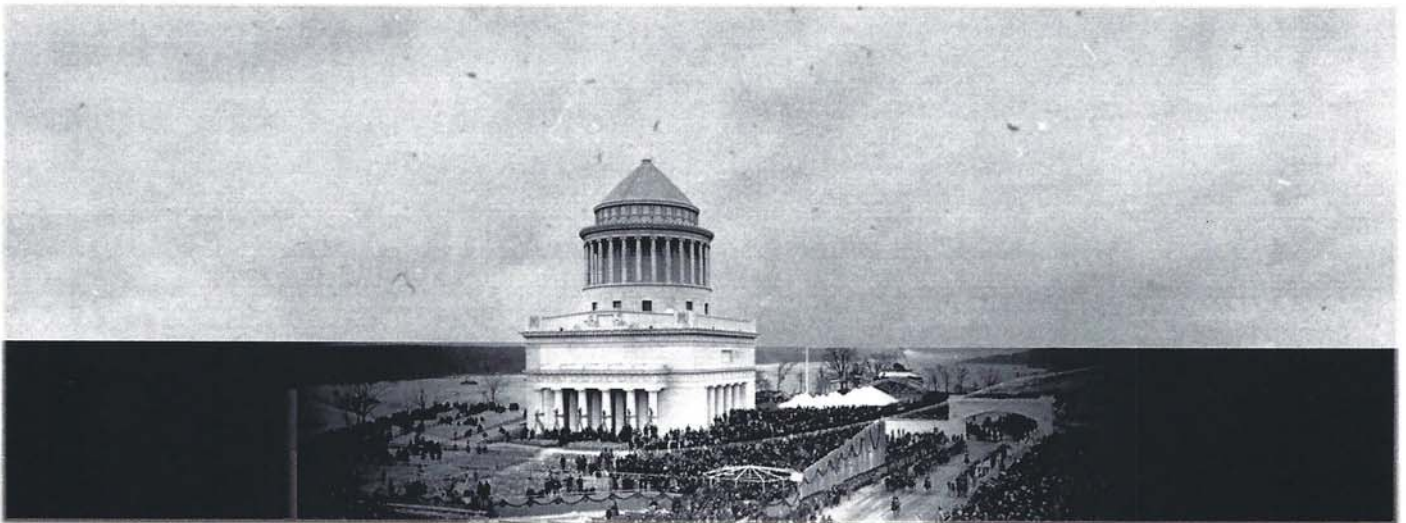
Dedication of the Monument for Ulysses S. Grant, April 27, 1897