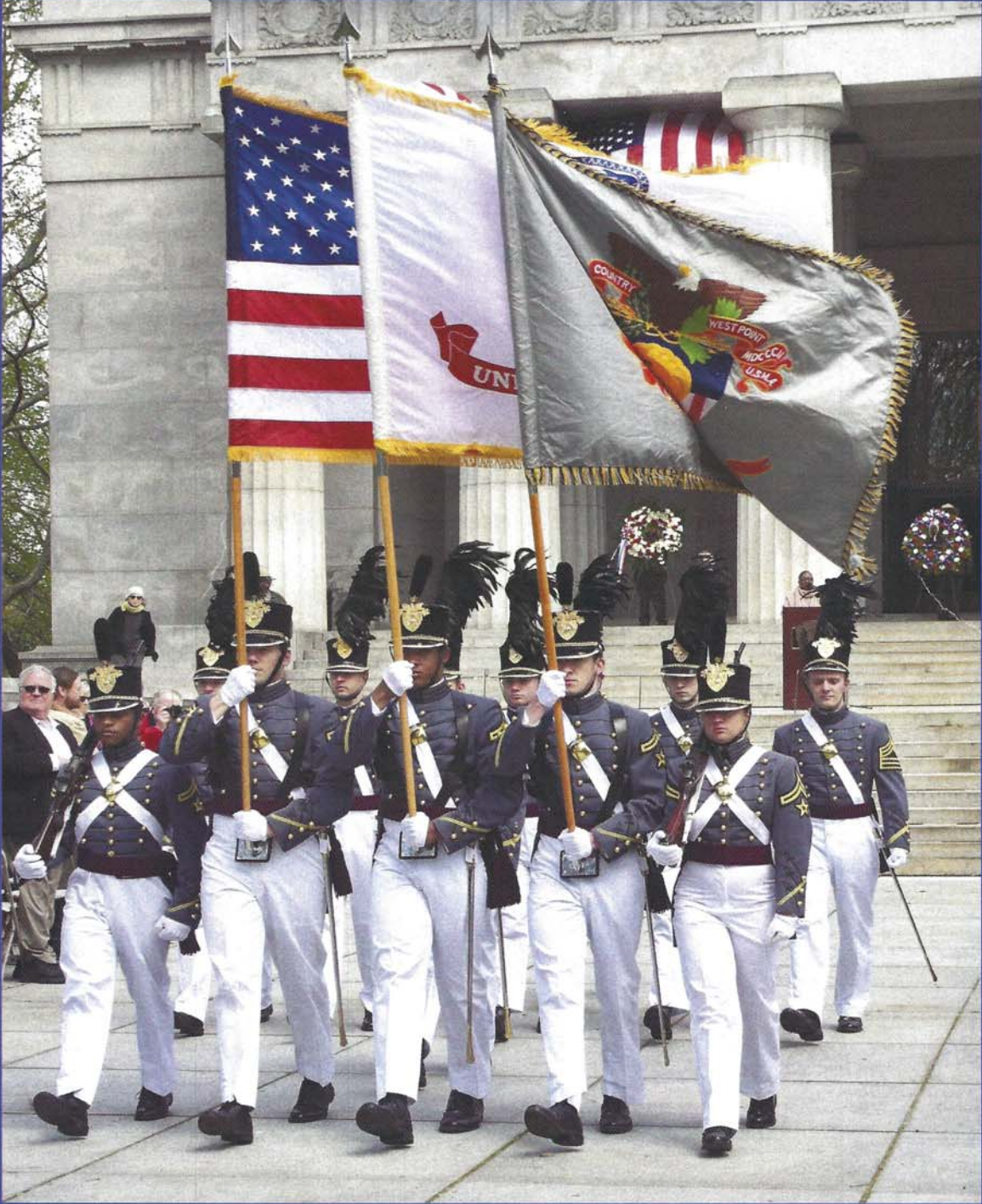
General Grant National Memorial